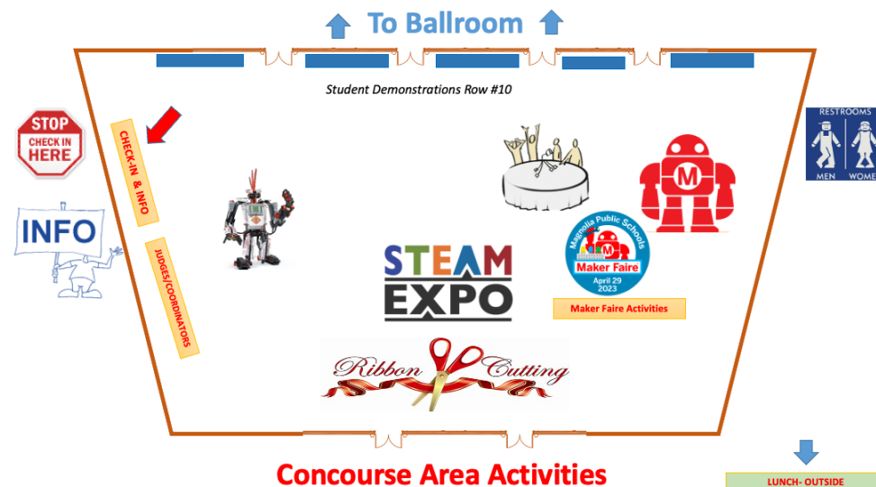
Concourse Area Activities